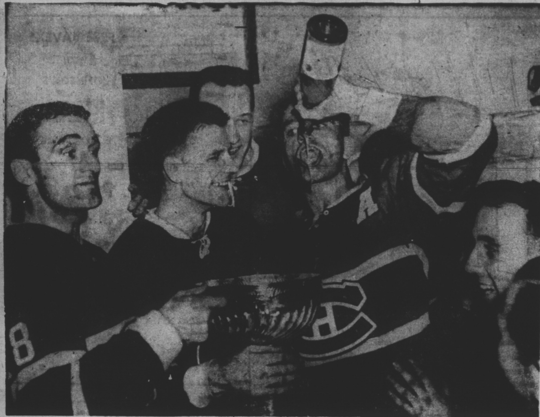
THE BUBBLY WATER FLOWS