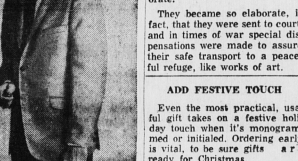
CHECK CASUAL wear for gift ideas; he may well be in need of a new sports jacket. There are now many new styles ready for giving.

Typical was the leopold doll of ancient Egypt which was made from a single, flat piece of pottery or wood. Although dolls today may be extremely complex and filled with electrical gadgets, dolls of the 17th and 18th centuries frequently were even more elaborate. They became so elaborate, in fact, that they were sent to court, and in times of war special dispensations were made to assure their safe transport to a peaceful refuge, like works of art.