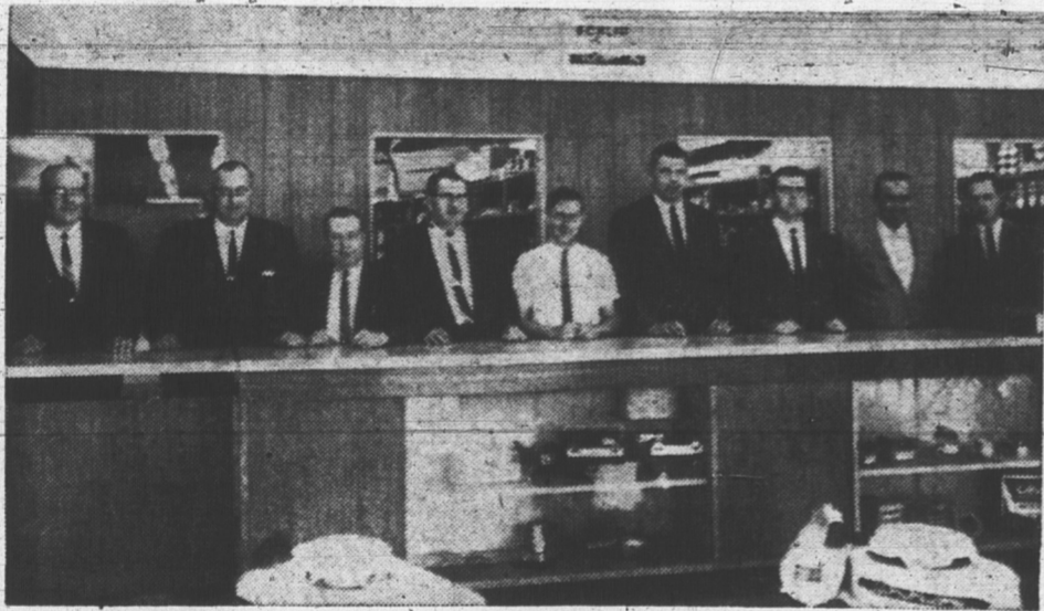
Pictured above is our large parts department and its complete staff