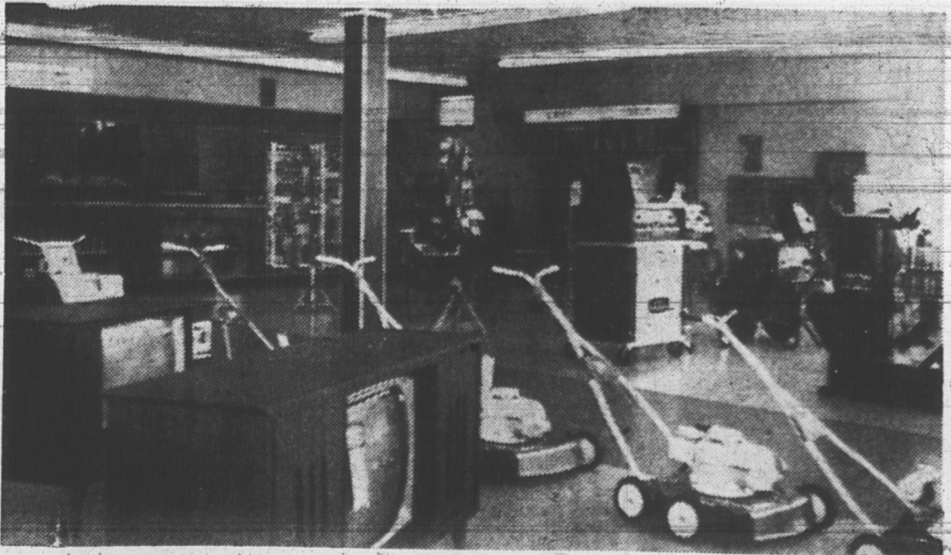
Pictured above is our spacious showroom where you will find all top quality brand name merchandise on display.

Also featuring Spartan TV. and stereo from the small 12 inch portable model to our 22" 3-way combination.