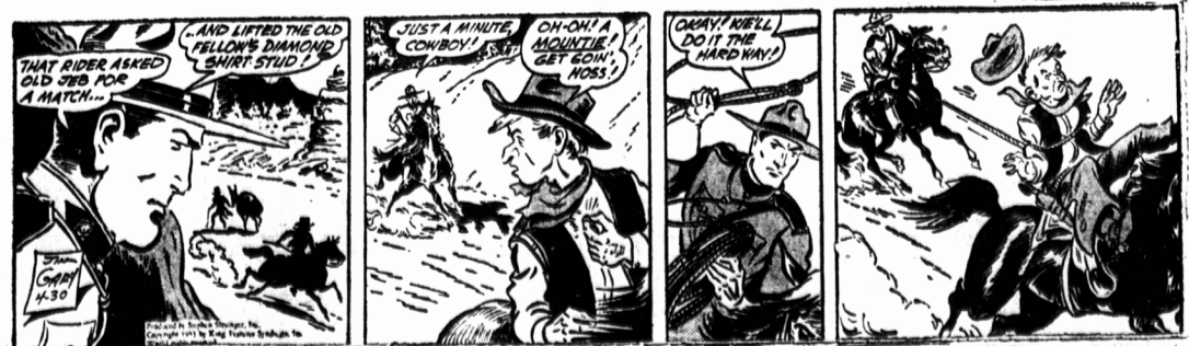
By Zane Grey