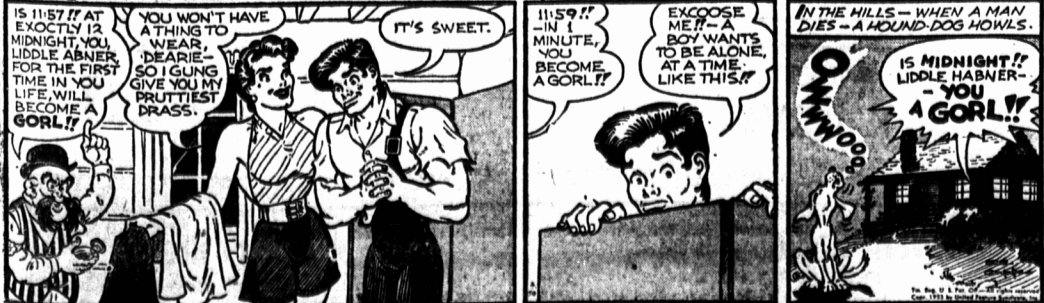
By Al Capp