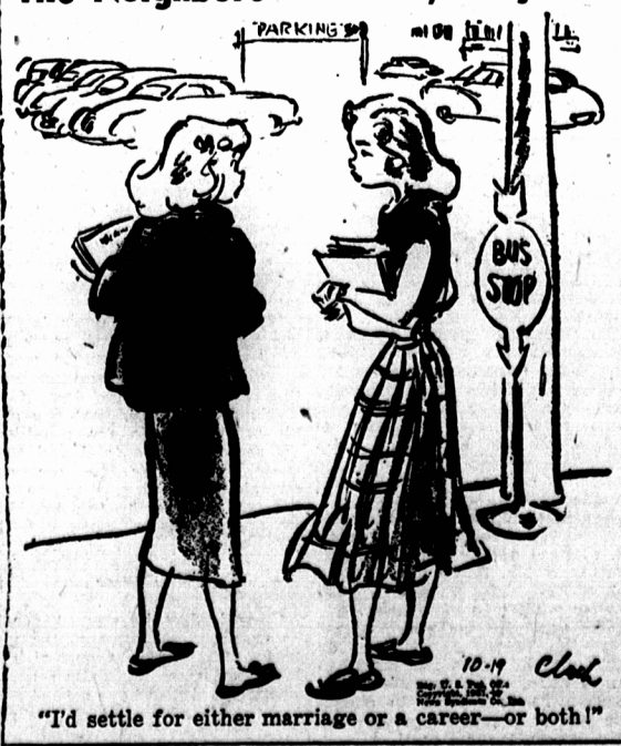
"I'd settle for either marriage or a career—or both!"