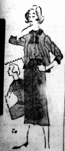
By VERA WINSTON

portion into a long roll about 1 1/2" in diameter. Cover with a damp cloth and let rest 15 mins. Using a floured sharp knife, cut dough into 2" lengths and place, well apart, on ungreased cookie sheets. Sprinkle rolls with cornmeal and let rise, uncovered, for 1/2 hour. Brush with cold water and let rise another 1/2 hour. Meanwhile, stand a broad shallow pan of hot water in the oven and preheat oven to hot, 425°. Remove pan of water from oven and bake the rolls in steam-filled oven for 1/2 hour, brushing them with cold water and sprinkling lightly with cornmeal after the first 15 mins., and again brushing them with cold water 2 minutes before removing baked buns from the oven. Yield—18 rolls.