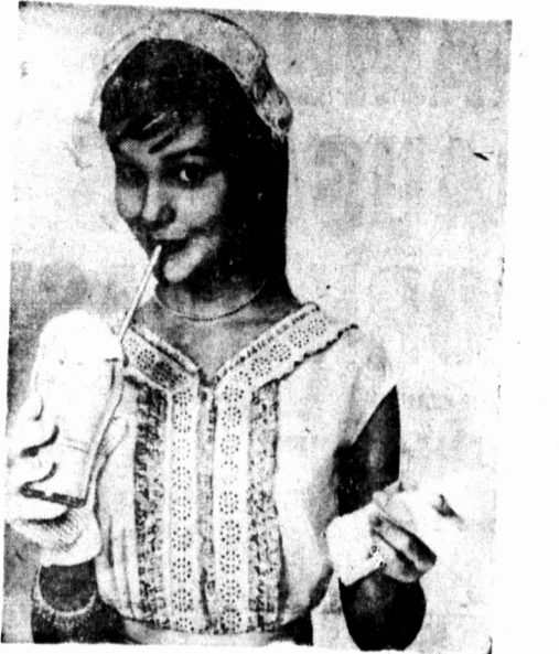
DAINTY AND FEMININE