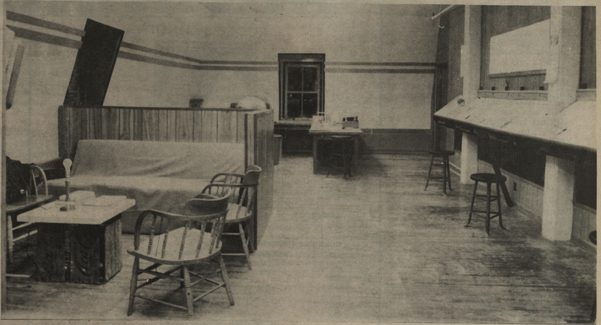
The office is empty.

We finally figured out why no one is coming up to help us out at the SUN. You just didn't know how to find us. So for those of you who are having trouble, we have included a map. All you have to do is follow this simple path and our friendly staff will meet you at the door. Bon Voyage!