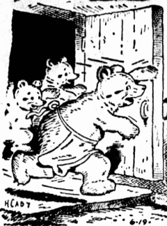
Out of the open door rushed Mother Bear with the two cubs at her heels.

Over at the sugar house in the Green Forest there was a sudden silence. There had been a great racket there. It had sounded as if some one were tearing everything to pieces inside. Farmer Brown's Boy and another boy had been startled by the noise as they approached the sugar house. Farmer Brown's Boy had yelled for whoever was in there to come out. At the same time he had picked up a stout stick. Now there was stillness that could almost be felt. There was not a sound of any kind inside that little house. You