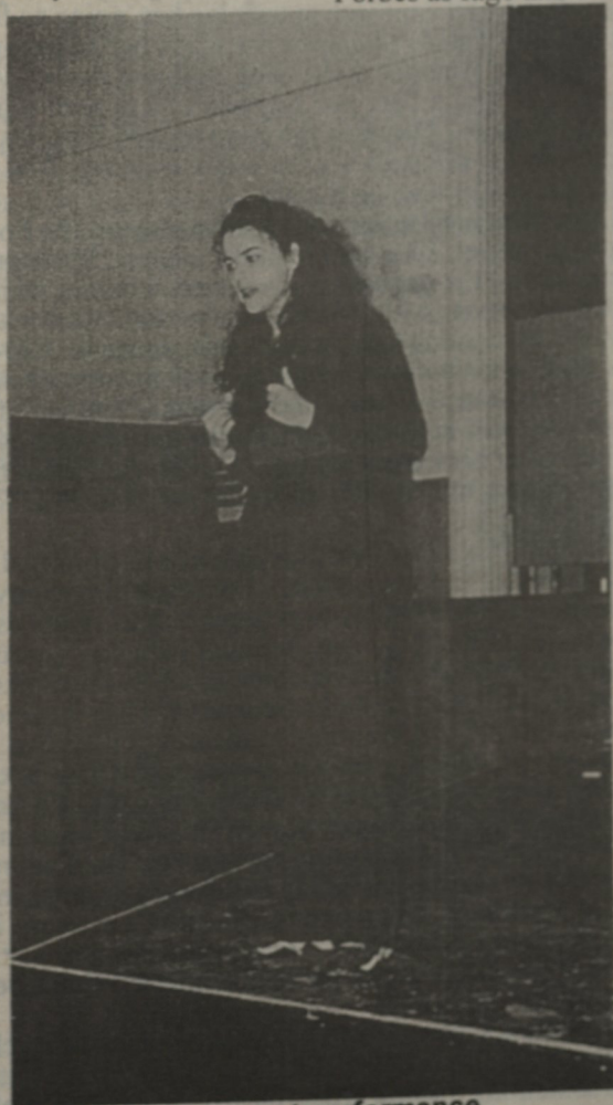
Hard work, before a great performance

At the end of the evening, the audience expressed their pleasure with the play with enthusiastic applause, resulting in two curtain calls. All in all, Goodnight Desdemona (Good Morning Juliet) was a strong note for the end of the Theatre Society's year.