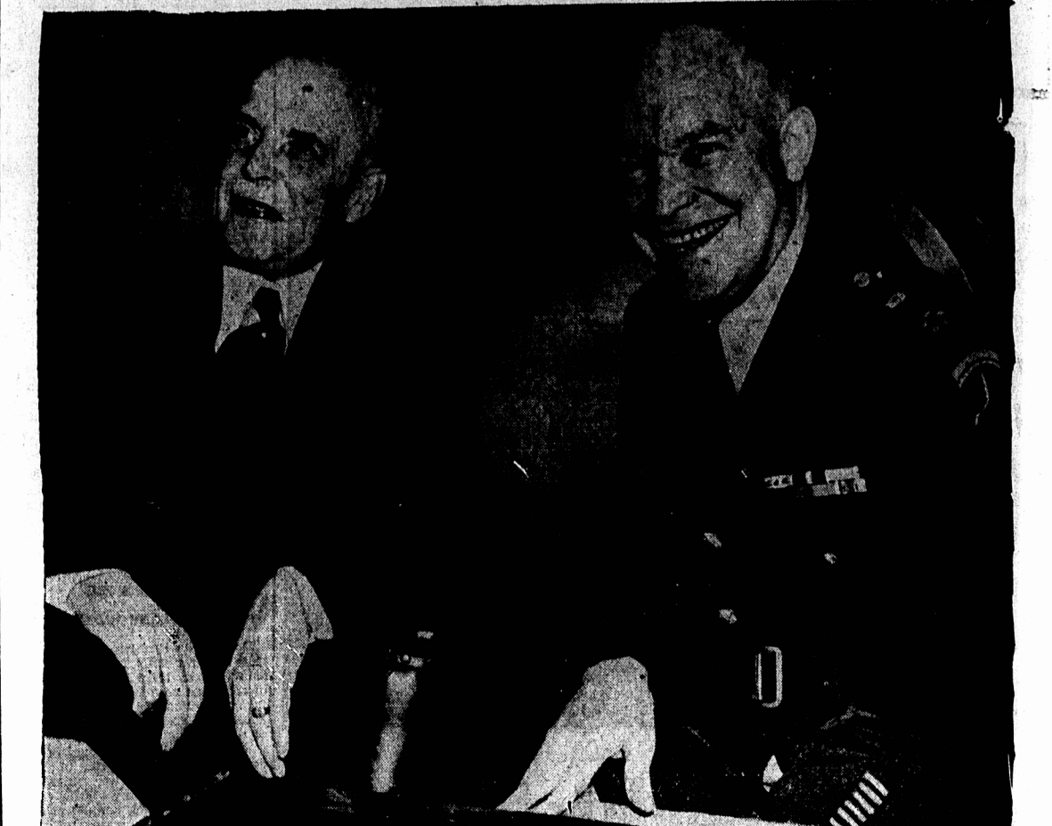
"Quite Impressive" was the reaction of Gen. Dwight Eisenhower to Ottawa. He is shown with Prime Minister Louis St. Laurent, left. The supreme commander of the North Atlantic Pact agreed with the Canadian view that Europe is the key point in maintaining world peace.