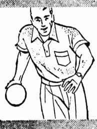
(Centre) Crew neck style in cool combed cotton interlock with French piping on "V", pocket and sleeves. (Bottom) Especially cool "eyelet" fabric. Casual comfort with dress shirt smartness. Generous length.

You can tell it was a man who designed our handsome new range of T-shirts for summer. By cut and colour he has cleverly supplied that deep-chested, broad-shouldered, athletic look. His masterpiece, however, is the collar—not limp and saggy like you've been used to after the first laundering at the lake—but trim, clean-cut, easy-fitting—and Sanforized-lined to stay that way, too. Carefully made of the most suitable fabrics—like everything you buy signed with the Harvey-Woods label. You are assured of long, comfortable wear, usual Harvey-Woods quality.