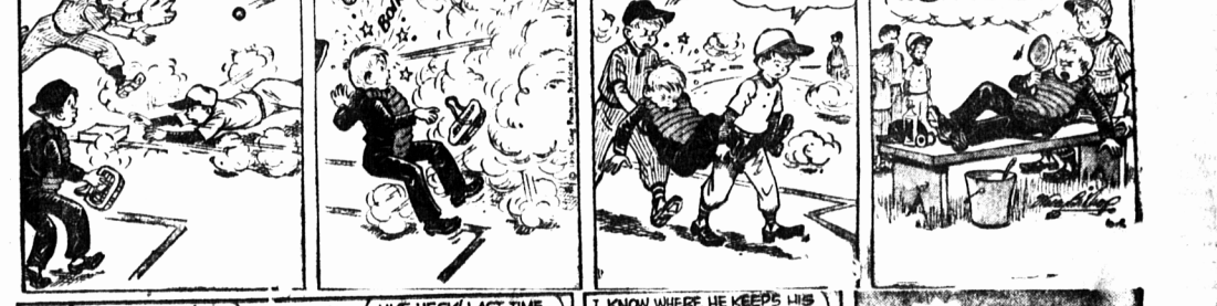
Muggs and Skeeter