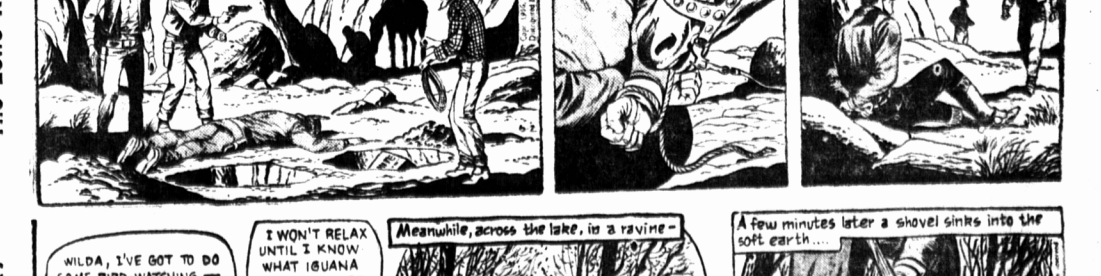
The Lone Ranger