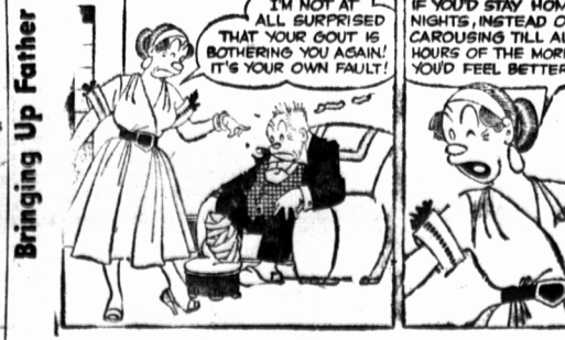
Bringing Up Father