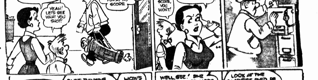
Tilly The Toiler