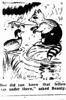
How did you know that fellow was under there," asked Beauty.

How did you know that fellow was under there?" asked Beauty. He meant the crayfish. Bobby grinned. "I didn't know he was there," said he. "Then, I saw you manage to get him," asked Beauty. "I just felt around under there until I touched him, then I grabbed him," explained Bobby. "Is that the way you always do?" Beauty wanted to know. "Mostly," replied Bobby. "I catch things that way too. I don't have to see them. My fingers know what they are touching." "Are you living near here?" asked Beauty. Bobby Coon didn't answer this directly. "I'm looking around," said he. "Are you and Mrs. Beauty living down at Paddy the Beaver's pond?" "Not exactly," replied Beauty. "That must mean that you are living somewhere near it," said Bobby Coon. "I was wondering if you had found a hollow tree big enough for your nest. How many eggs has Mrs. Beauty laid this year?" Beauty pretended not to hear that question. He was beginning to worry again. He knew that Bobby Coon had a liking for eggs. What if he should find the new home with the nest in it?