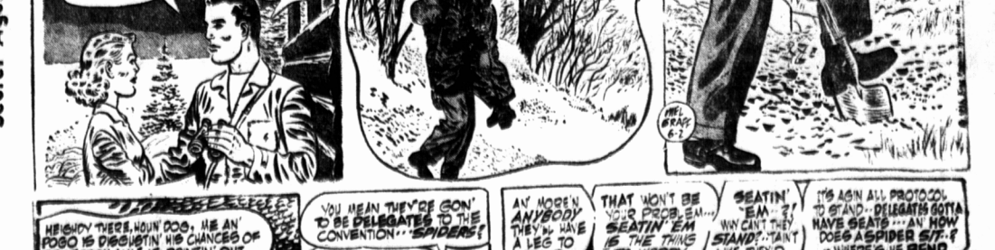
Secret Agent X9