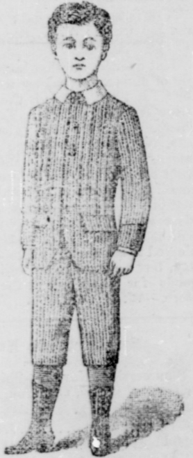
SEE OUR Boys' Suits, Reefers and Overcoats.