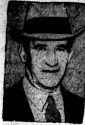
After discovering the rich Lake Shore gold mine at Kirkland Lake, Oakes, seen above, lived for a time at Niagara Falls, Ont. Later, to avoid heavy taxation, he moved to the Bahamas. It has been rumored that murder was committed so that Lady Oakes could re-marry.