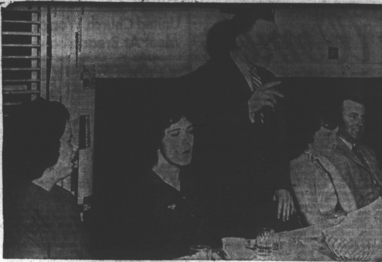
SING SONG ENJOYED AT BANQUET. A lively sing-song followed the Zeta - Phi Junior Hi - Y Club father and daughter banquet at the YMCA banquet room last night.