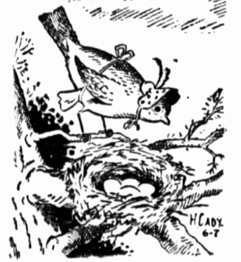
In this way Sally Sly found most of the nests of other birds.

This is a true saying. No one likes folks who are forever trying to find out things by peeking and sneaking about, trying not to be seen. In the spring Sally Sly the Cowbird is a sneak. She spends most of her time trying to keep out of sight while stealing about and trying to find out all about her neighbors. She is very clever about it. At other times she is happy-go-lucky and intent only on having a good time.