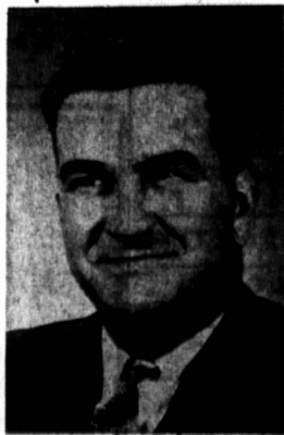
J. ANGUS MacLEAN