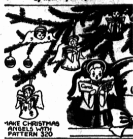
MAKE CHRISTMAS ANGELS WITH PATTERN 320

These angelic figures made of stiff paper and painted in bright colors will be found most useful at Christmas time. The pattern gives tracing diagrams for a variety of sizes and styles. Some stand 8-inches high holding a song book. There are several sizes for tree decorations. And for hand-painted greeting cards that just fit an ordinary envelope. Each step is illustrated on the pattern from tracing the outline of the figures to the fascinating part of using ordinary water colors to bring out the unusual realism of these figures. This pattern is 320 and may be ordered separately at 35 cents or it will be included in the Christmas Decorations Packet of five standard size patterns for only $1.50 postpaid. Guardian Pattern Dept., 4433 West 5th Avenue, Vancouver, B. C.