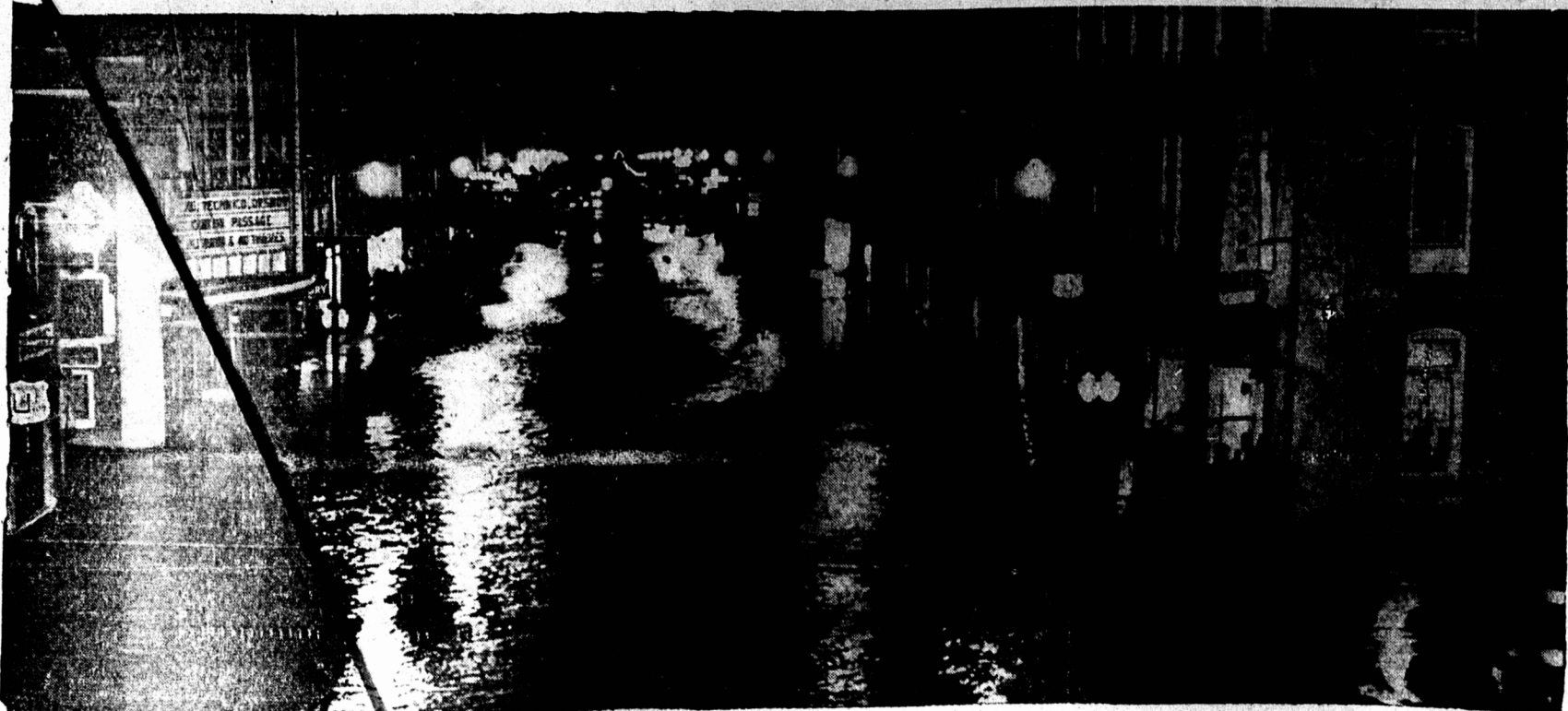
Brampton's main street was covered with more than a foot of water as Ontario's Etobicoke creek went on its annual rampage. Sign on theatre marquee instead of "Canyon Passage" could well have been "Canal Passage" for the evening. During the flood scores of children