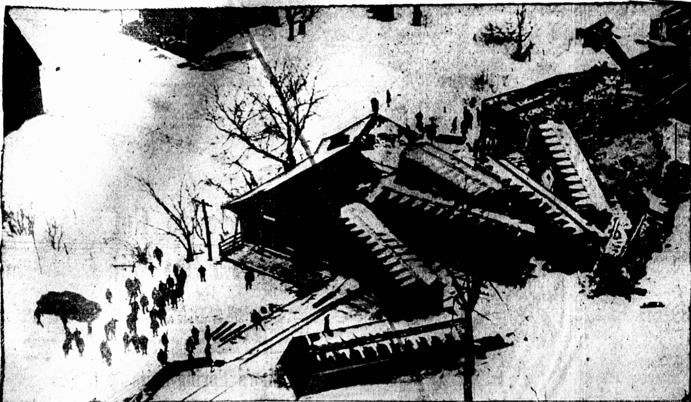
An inquiry has been launched by C.P.R. officials to determine cause of train collision between two freights which killed two men and injured two others in snowstorm at