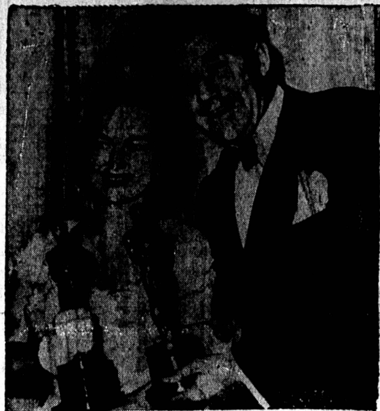
TO THE VICTORS BELONG THE "OSCARS" — Olivia de Havilland, left, and Broderick Crawford, right, are shown with their Oscars awarded them by the Motion Picture Academy of Arts and Sciences in Hollywood, Calif., for being the best actress and actor of the year, respectively. Miss de Havilland received her award for her outstanding performance in the "Heiress," while Crawford received his for his performance in "All the King's Men." The presentations were witnessed by more than 2,500 fans at the 22nd annual "Oscar" award ceremonies.