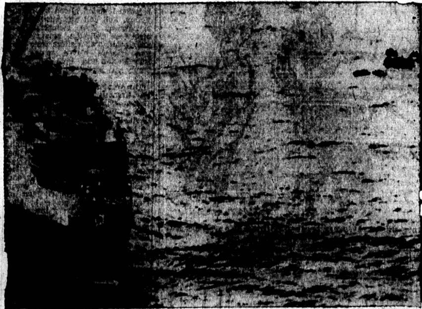
ALL 44 SAFE—The Navy repair ship USS Comstock stands by to pick up 24 crewmen (upper right) of the net tender USS Elder in shark-infested waters some 600 miles from the Eniwetok atomic testing area. The rescued men had been adrift for a week, following an explosion and fire aboard their ship. Fourteen others remained aboard the crippled vessel to fight the blaze. A military transport reportedly passed up the Elder.