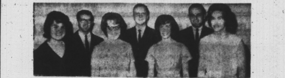
Emmaus Bible School, Oak Park, Ill.

Share Their Joy and Faith In Jesus Christ