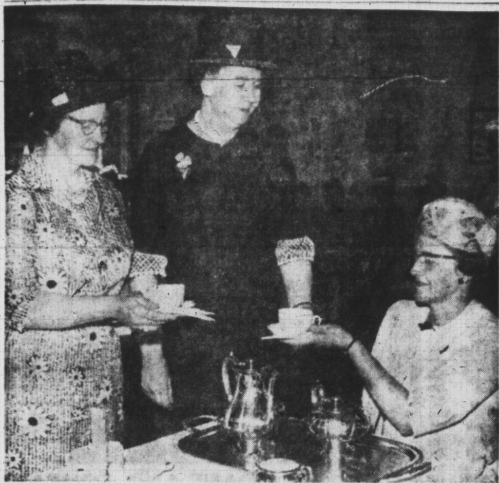
TEA AT MONTGOMERY HALL

Afternoon tea was served to members of the Provincial Women's Institute at Montgomery Hall following the final sessions of the annual meeting.