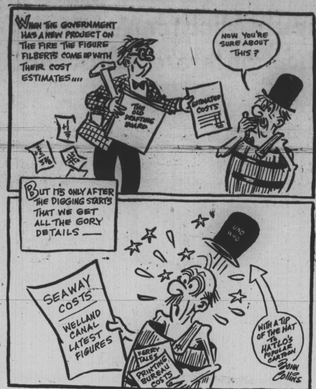
THEY'LL DO IT EVERY TIME

The Great Atlantic and Pacific Tea Company—popularly known as A and P—recently observed its 100th anniversary. It began as a small tea store on a side street in New York. Today it has a chain of more than 4,000 supermarkets extending throughout the United States. In addition, the company operates scores of warehouses, bakeries, coffee roasting plants, milk plants and a salmon fishery fleet and canneries. It employs more than 145,000 persons. Its annual sales come to about $5 billion.