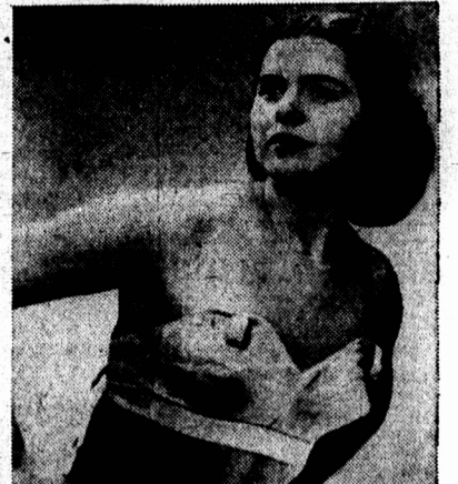
Twist or turn... miracle Cordtex still does the UP!ift! You see, Gothic shoulder straps are there for added control... not to tug!