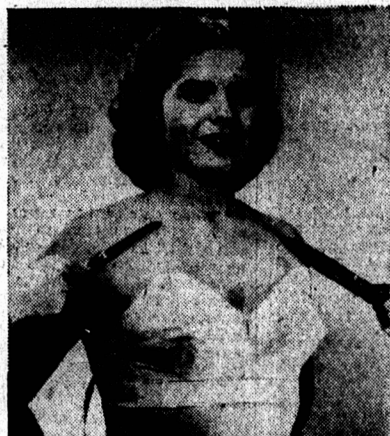
Snip go the straps! See how all the up-lift continues... even after the straps have been cut. Gothic's exclusive Cordtex inserts are the answer!