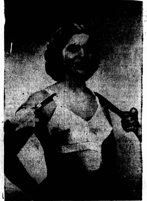
This pretty Montreal housewife and mother, age 26, models her favorite Gothic Bra. Remember, there's a Gothic style to flatter every figure.

Actual photostory proves you'll be more comfortable in a Gothic Bra!