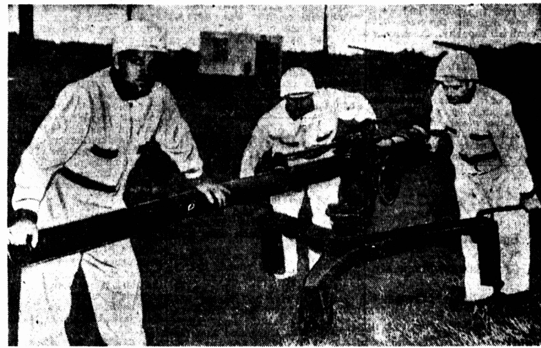
Weighing less than 500 pounds, the BAT can be lifted by its three-man crew, as shown in the photo. It has double the effective range and double the penetrating power of any weapon previously available to the infantryman. It can be fired from a jeep, then taken off in one minute and fired or hauled around on a wheelbarrow-type base. According to the army, the weapon is capable of knocking out the largest known tanks.