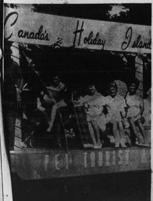
TOURIST ASSOCIATION DISPLAY