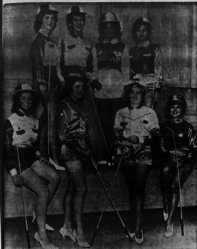
MEET THE PATRIOT GOLD CUP AND SAUCER GIRLS