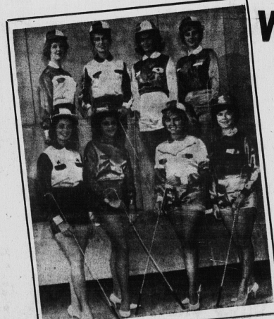
The Evening Patriot Gold Cup & Saucer Girls