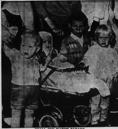
SMALL FRY WATCH PARADE