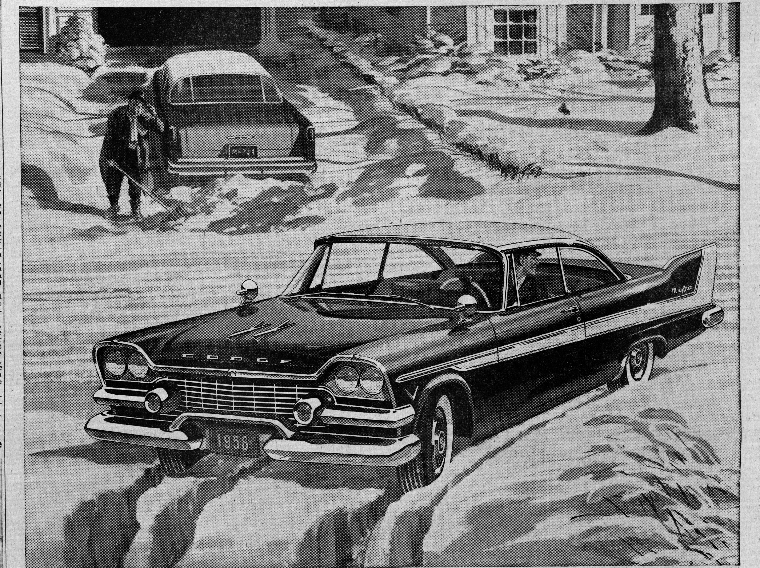
New Sure-Grip differential, on this Dodge Mayfair 2-door hardtop, gives you easy going where others get stuck!