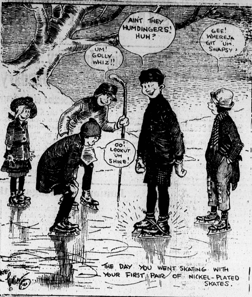
THE DAY YOU WENT SKATING WITH YOUR FIRST PAIR OF NICKEL-PLATED SKATES.