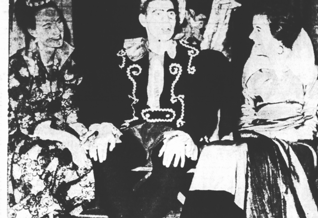
ST. DUNSTAN'S PLAYERS IN MEDIEVAL COSTUME

99c For Free Delivery GROCERIA HOME OF FINE FOODS