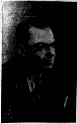
HON. PAUL MARTIN

Minister of National Health and Welfare, speaks at Summerside on Thursday evening, April 25.