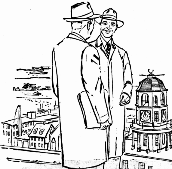
Citadel Hill, Halifax, Nova Scotia

Stewart Motors Ltd. Your Mercury Dealer Phone 831 -- 224 Gt. Geo.