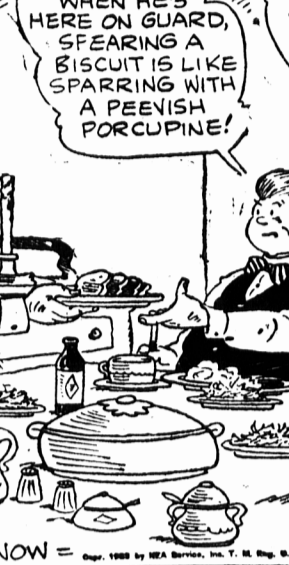
It's OPEN COMPETITION NOW =