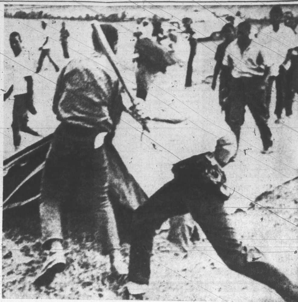
A Greenwood policeman rushes in to arrest Stokely Carmichael.