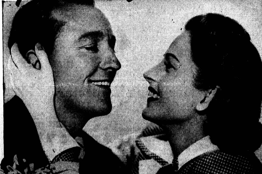
COLEEN GRAY as she plays opposite BING CROSBY in Paramount Pictures' "RIDING HIGH" says COLEEN GRAY

"Lux Soap facials really make my skin softer, smoother," says Coleen Gray. Yes, actually 3 out of 4 complexions improved in a short time in recent tests by skin specialists. See what this gentle care can do to make your skin lovelier. Work the creamy lather in well, rinse, pat with a towel to dry. You'll agree with Coleen Gray, who says: "Skin takes on new beauty so quickly!" Try the generous bath size Lux Toilet Soap, too—so fragrant, so luxurious!