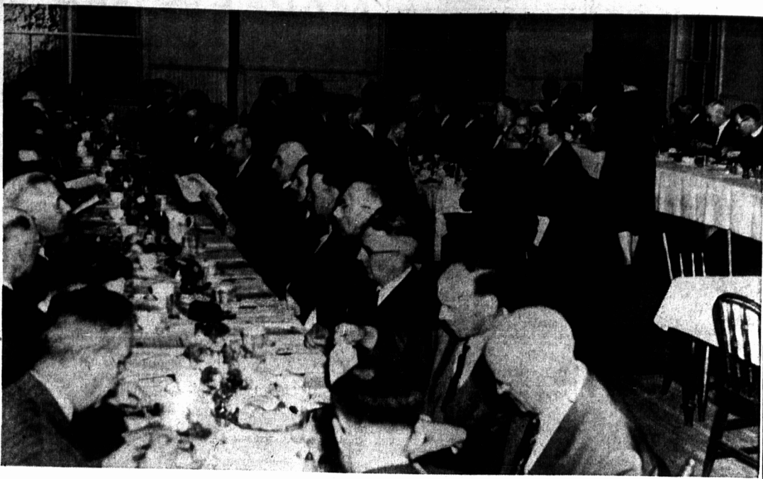
Above is seen a group of United Churchmen who attended the organizational banquet-supper meeting at Epworth Hall last Friday evening to formulate plans for the organizing of a United Church Men's Association in Summerside.

Burke Electric Authorized GE Dealer Electrical Wiring Repairing and Supplies Oil Heating Household Appliances Television 156 Great Geo. St. DIAL 4021