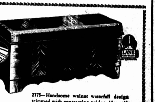
2775—Handsome walnut waterfall design trimmed with contrasting pialdo. Has self rising tray. Rubbed and polished finish.

This Christmas Give Gifts Of Lasting Pleasure — * Gifts That Beautify * Gifts That Are Useful * Gifts That Keep on Giving every day of the year.