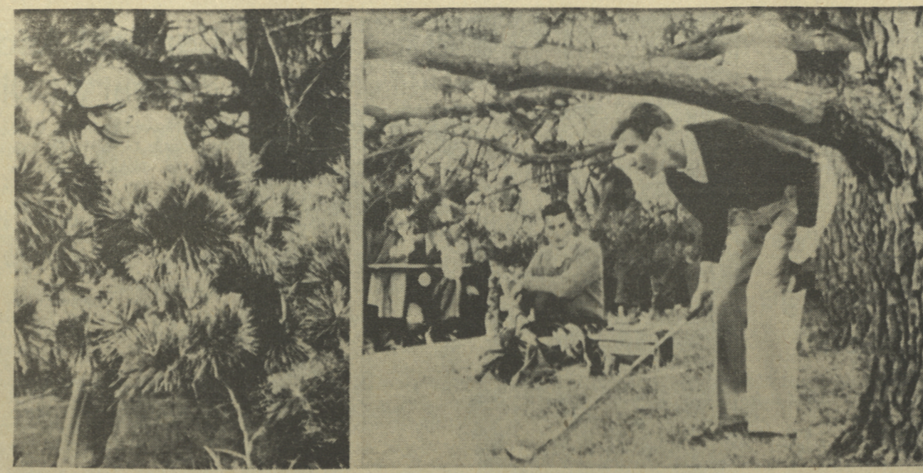
BRANCHING OUT ON FAIRWAY