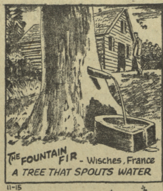
THE FOUNTAIN - Wisches, France A TREE THAT SPOUTS WATER