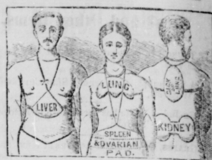
ST. JOHN'S, NEWFOUNDLAND, June 30, 1883.

Bill-heads, Letter-heads, Notes of Hand Receipts, Posters, Handbills, Dodgers, etc., etc., done in first-class style and at short notice.