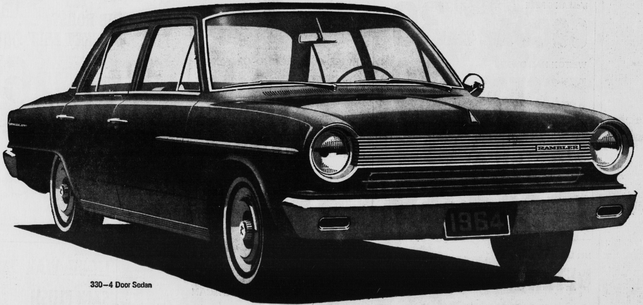
330—4 Door Sedan

guaranteed Ceramic-Armoured muffler system, guaranteed battery and coolant, battery-saving alternator, self-adjusting Double-Safety-brakes, reclining seats, 3-year or 30,000-mile lubrication, and 2-year or 24,000-mile warranty on the entire car. One thing is clear: the 1964 Rambler American continues the well-known Rambler philosophy of "maximum usefulness to the user." Prove it to yourself with a test drive. Tomorrow?