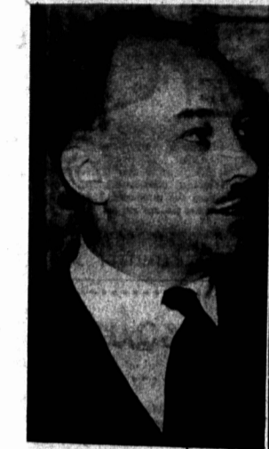
Premier Hicks is something of a political wonder boy. He was a member of the legislature at 30, education minister at 34 and premier at 39.