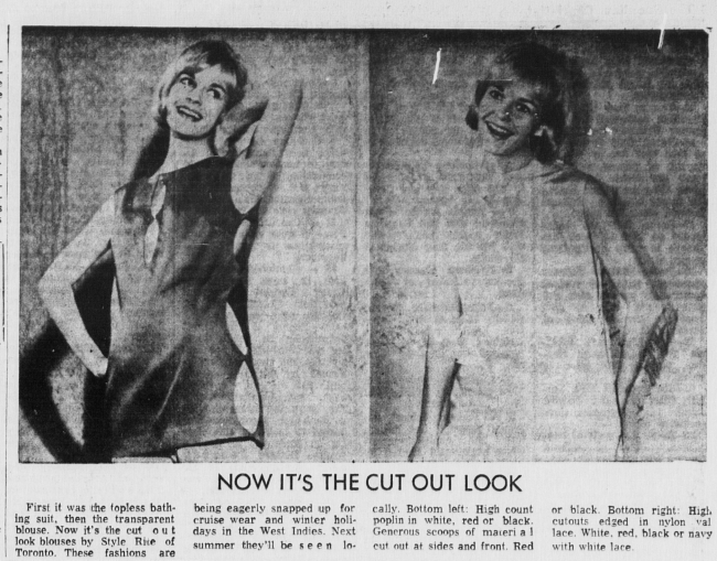
First it was the (topless bathing suit), then the transparent blouse. Now it's the cut out look blouses by Style Rise of Toronto. These fashions are

That happy holiday season is here once again with parties and family get-togethers. The Guardian - Evening Patriot invite the submission of social news which published free of charge. Do you have someone visiting with you that friends might like to contact? There's no better way to spread glad tidings than through the social column of your newspaper. Tea, luncheon, bridge and stock shows, staff parties or your regular "bridge" club dinners are only a few suggestions. Phone 45866.