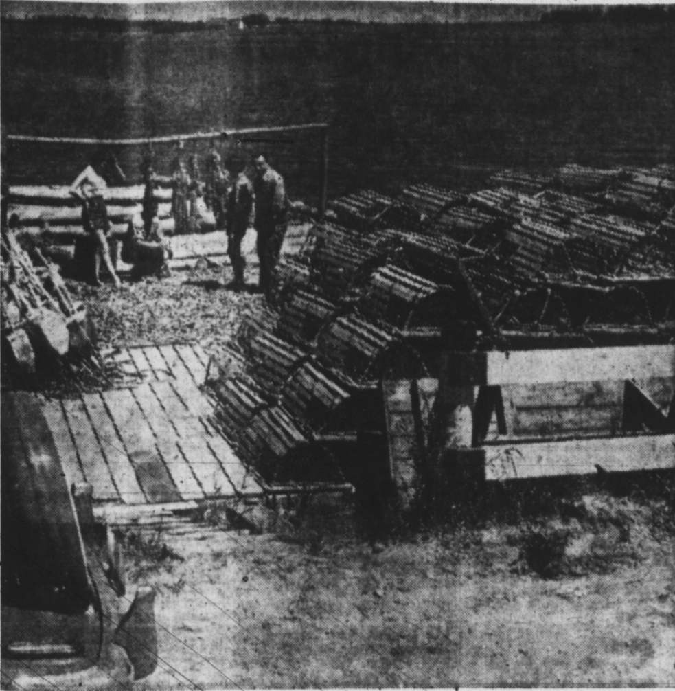
LOBSTER FISHERMEN OF P. E. I.

Don't let it happen to you, get KODAK FILM here! McInnis Photo-Hobby 111 Kent St. Ch'town