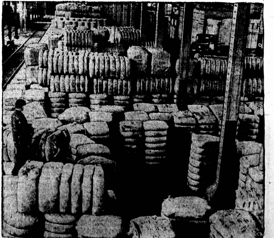
BALE, BALE, THE WOOL'S ALL HERE — Because of the long strike of New England Woolen and Worsted Mills workers, Boston's Commonwealth Pier was jammed with hundreds of bales of wool. Traffic into the pier was halted altogether when three shiploads more arrived almost simultaneously.