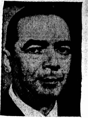
Former New York mayor, William O'Dwyer, is in his old stamping grounds to testify in U. S. Senate gambling probe. O'Dwyer described the syndicate "Murder, Inc." to the hearing and named the directors as Joe Adonis, the late Bugsy Siegel, Meyer Lansky, Willie Moretti and "Lucky" Luciano. Mr. O'Dwyer, now U. S. ambassador to Mexico, also testified that he may have gotten help from a friend of the fabulous Frank Costello in his 1945 mayoralty campaign.