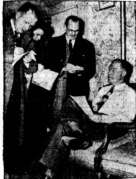
QUITS AFTER ULTIMATUM —James J. Moran (seated) reads his resignation statement to reporters in New York, bowing to Mayor Vincent Impellitteri's ultimatum that the water commissioner resign or face trial. The ultimatum was a result of a revelation before the Senate Crime Investigating Committee that Moran was given $55,000 in gifts by the head of the Uniformed Firemen's Association.