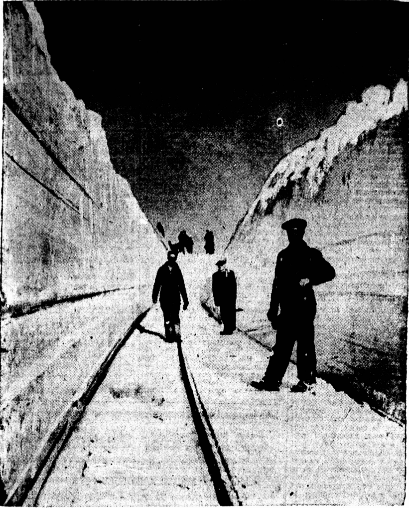
No shortage of snow exists in Alberta on first day of spring where railway section is shown after a 25-foot gash had been carved in drifts near Oyen where a passenger train was snowbound. Two plows broke down in the job and snow "mountain" was 150 yards long.