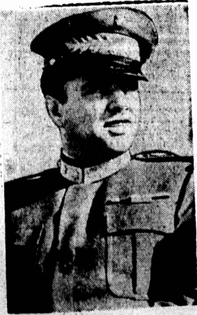
Albania, Russia's smallest and most inaccessible satellite, has proclaimed martial law to stop anti-Russian demonstrations, it was reported. Reports reaching London claim an estimated 5,000 Russian experts have taken over the country with its 1,175,000 population. The disorders, climaxed by a reported bomb explosion killing 17 persons, were considered the most critical of recent upheavals behind the iron curtain. Reports of bombings, attacks on Soviet officials, and subsequent Red reprisals have reached many of Europe's capitals. Regime of Albanian premier Enver Hoxha is endangered by threatened crack-down.