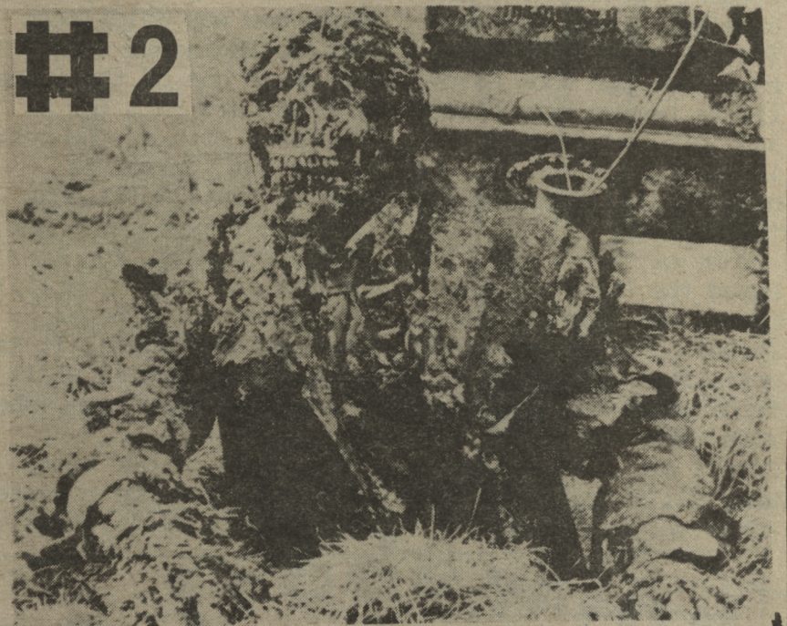
Caption #2: "I said I don't like roses. They give me a rash."