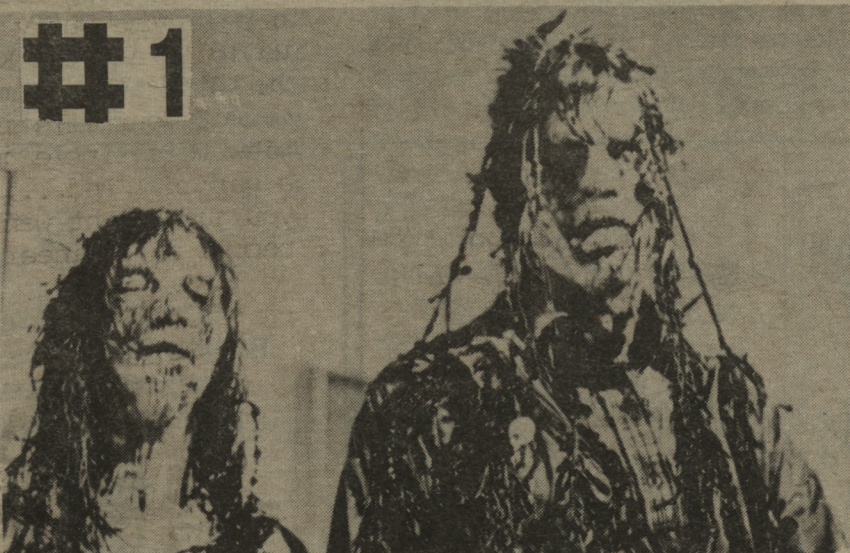
Caption #1: "Did you see the size of that pigeon?" "Shut up."