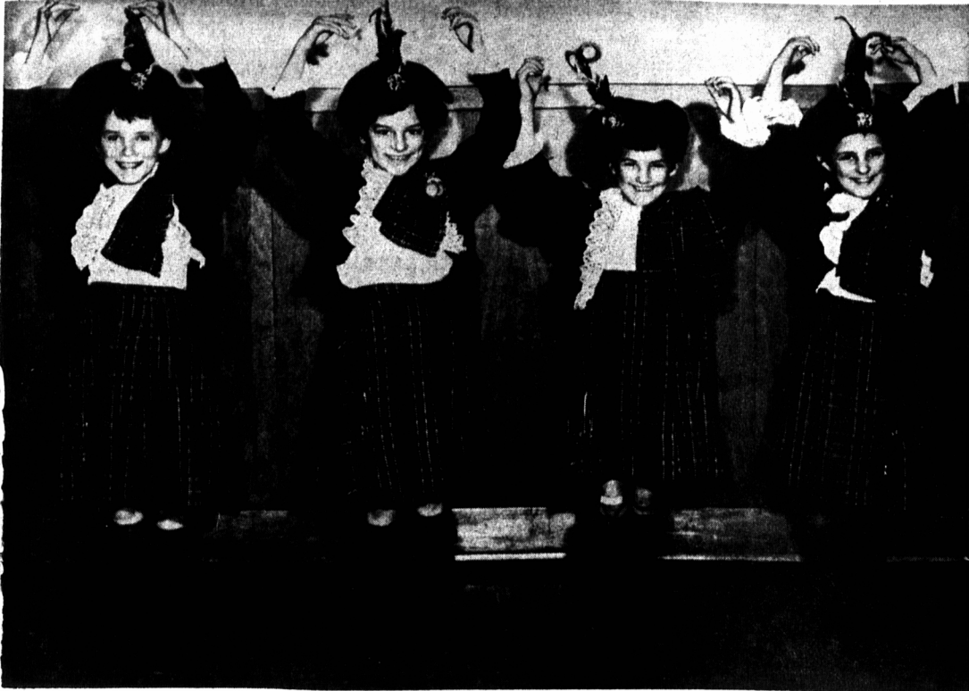
ORPHANAGE DANCERS ARE COMMENDED