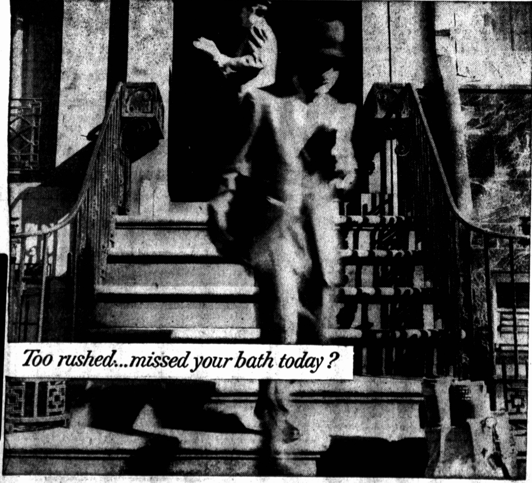
Too rushed...missed your bath today?

JACKETS — YOUR CHOICE OF CAR COAT, SUBURBAN, BLAZERS OR THE FAMOUS JAMES DEAN JACKET IN QUILTED LINED POPLIN, MELTON, FLEECE AND CORDUROY.