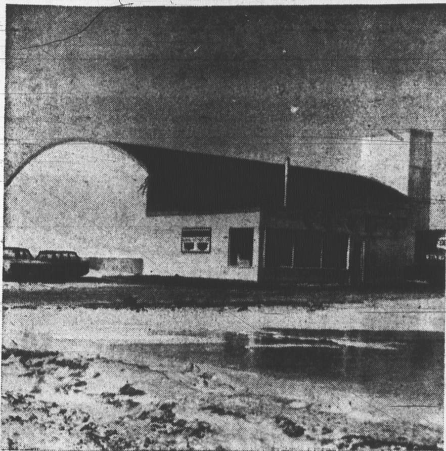
EXTERIOR VIEW OF AGRO CO-OP