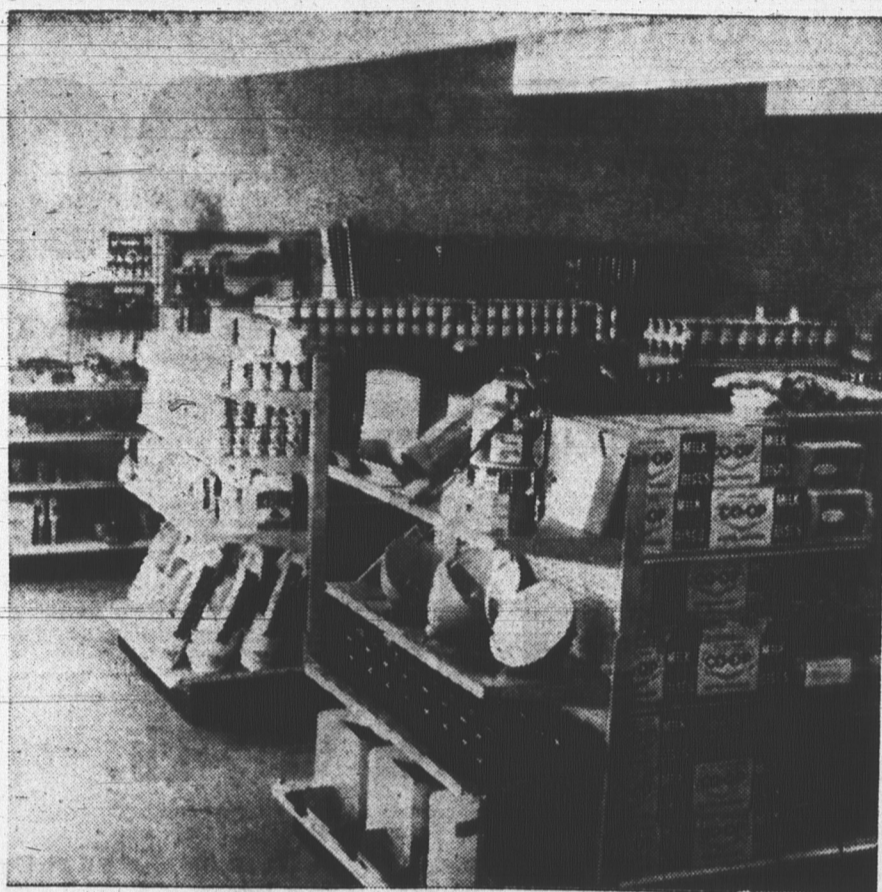
INTERIOR VIEW OF AGRO CO-OP