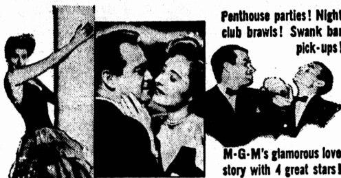
Panhouse parties! Night club brawls! Swank bar pick-ups!

LEARN ABOUT TWO-TIMING LOVE IN CAFE SOCIETY