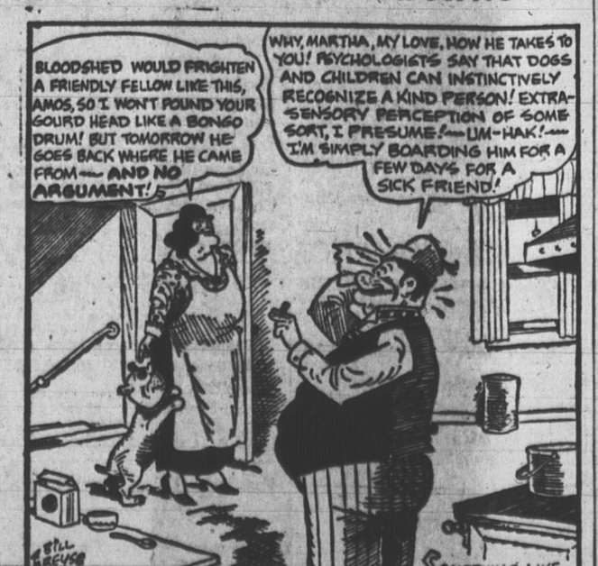
WHY, MARTHA, MY LOVE, NOW HE TAKES TO YOU! PSYCHOLOGISTS SAY THAT DOGS AND CHILDREN CAN INSTINCTIVELY RECOGNIZE A KIND PERSON! EXTRA-SENSORY PERCEPTION OF SOME SORT, I PRESUME. UM-HAK! I'M SIMPLY BOARDING HIM FOR A FEW DAYS FOR A SICK FRIEND!