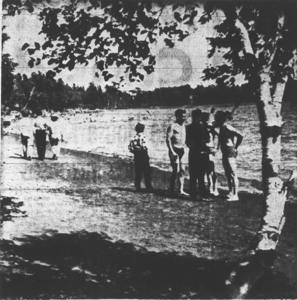
BEAUTIFUL BRUDENELL BEACH

Don't let it happen to you, get KODAK FILM here! McInnis Photo-Hobby 111 Kent St. Ch'town