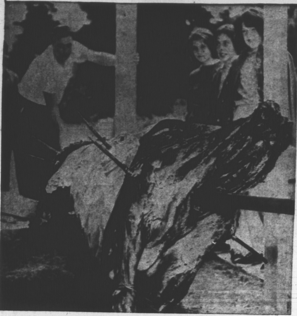
WHOLE STEER BARBECUED AT CARDIGAN