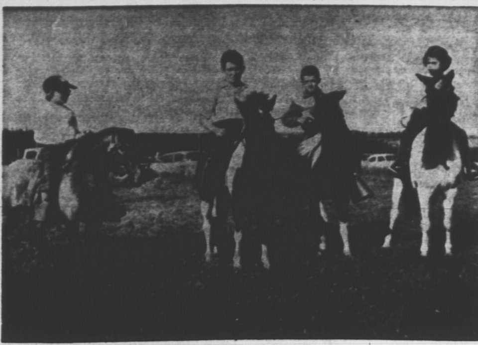
YOUNG VISITORS ENJOY PONY RIDE, MONTAGUE

SURPRISE SPOT Many tourists who have visited the area are surprised to find a place like Panmure Island beach which remains in its natural wild state with no crowding or traffic. This beach has the open sea on the one side with sun bathing and a sandy beach, while less than 25 yards away is St. Mary's Bay with sandy beach, and shallow water for hundreds of yards. This beach is considered to be one of the safest areas in the province for children and beginners. Between these beaches is a narrow causeway to Panmure Island. This is a natural sand causeway and once in living memory was cut in two so that residents had to drive in the sea to reach the mainland. The lighthouses in this area are another attraction to the area. WORTH SEEING Brudenell Island where a